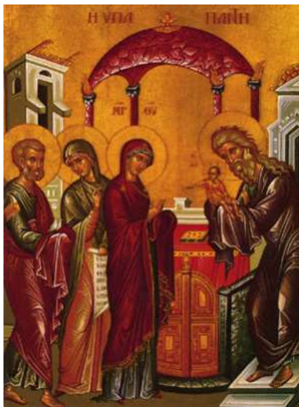
The Presentation of the Lord into the Temple