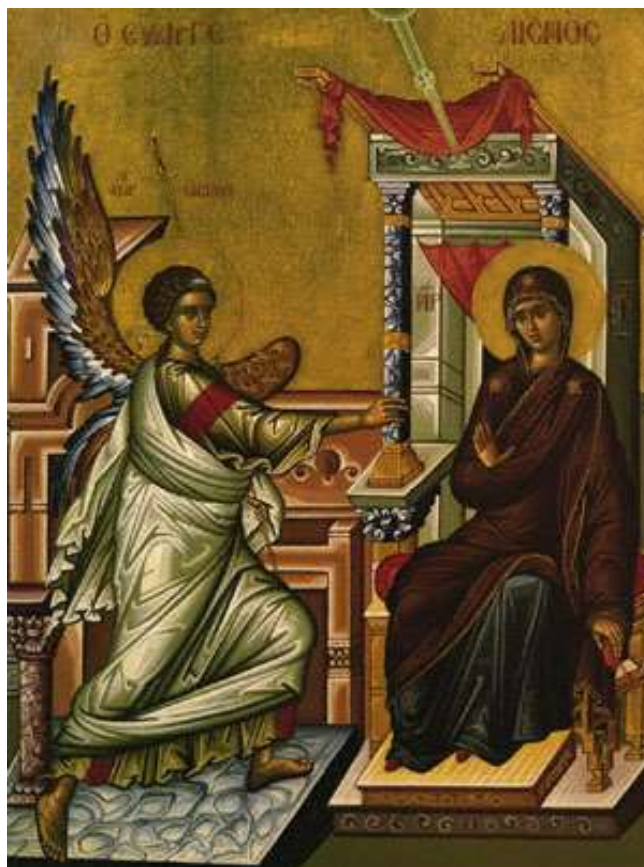
The Annunciation of the Theotokos, the Ever-Virgin Mary, and the Mother of God (Feast Day: March 25)