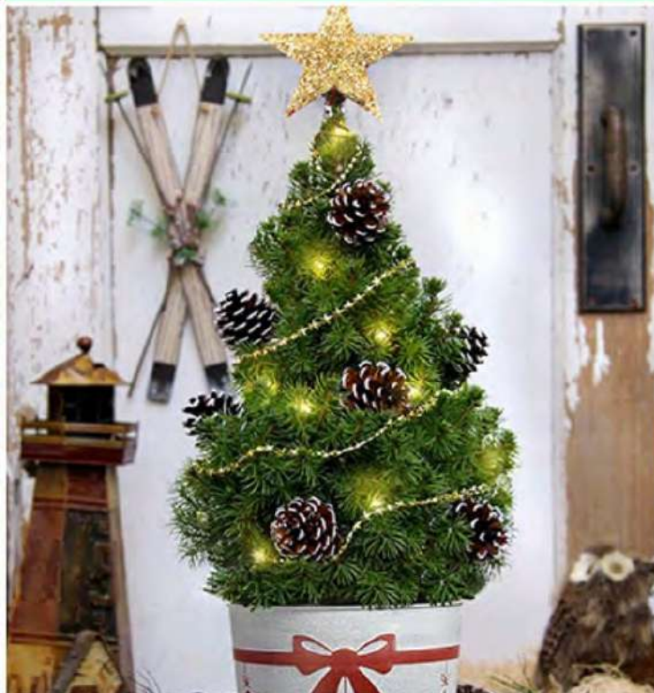
Table Top Christmas Tree $55.00

This unique Holiday decoration is handcrafted using a combination of Balsam Fir, Cedar, and Pine, and is decorated with the same elements as the Victorian Wreath. This Spray is often used in concert with the Victorian Wreath to create a matching Holiday theme for the home or can also be used by itself.