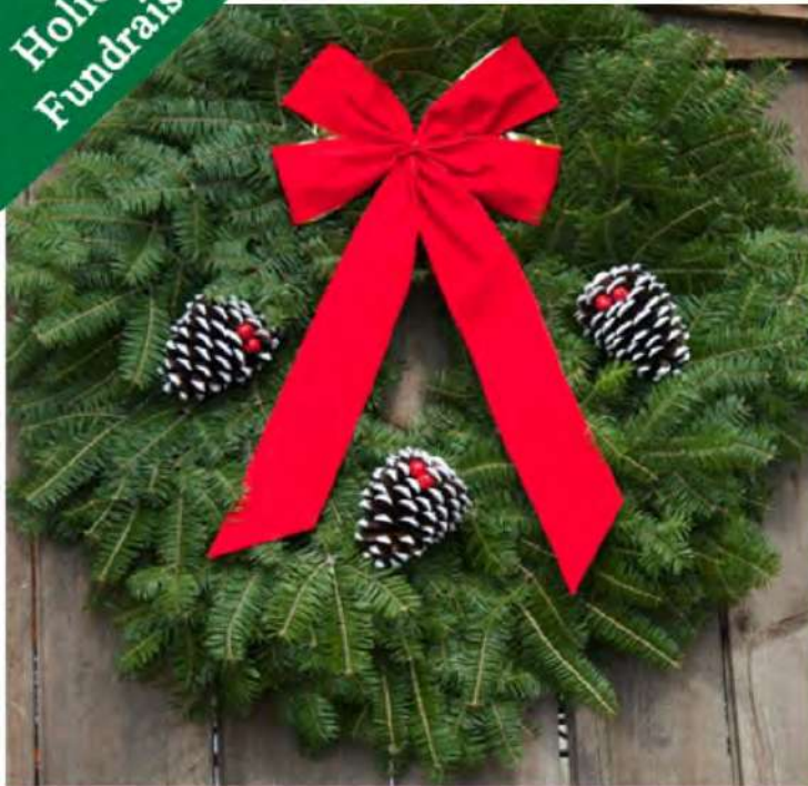
Classic Wreath $52.00-$59.00

The Classic Wreath is as traditional as Christmas itself – handcrafted with the freshest Minnesota Balsam Fir. This Wreath is beautifully decorated with selected, white tipped cones, festively accented with jingle bells and trimmed with a gold-backed red velveteen bow. Celebrate the holiday season with this traditional symbol of world peace.