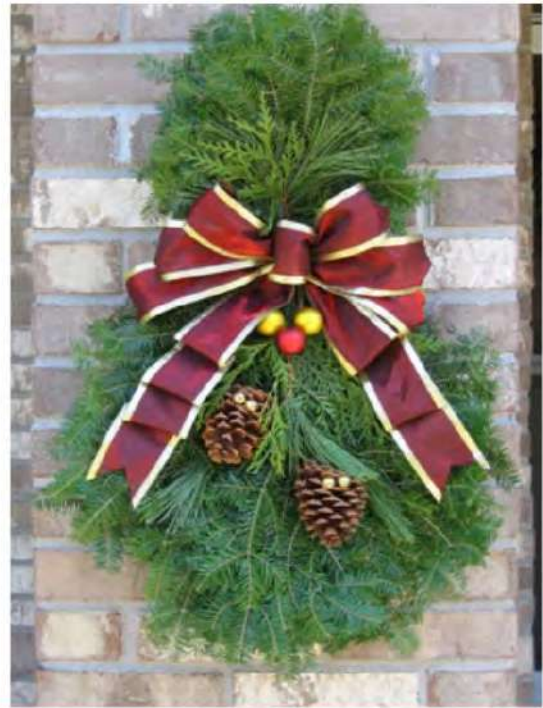
Victorian Spray $48.00-$51.00

The Classic Wreath is as traditional as Christmas itself – handcrafted with the freshest Minnesota Balsam Fir. This Wreath is beautifully decorated with selected, white tipped cones, festively accented with jingle bells and trimmed with a gold-backed red velveteen bow. Celebrate the holiday season with this traditional symbol of world peace.