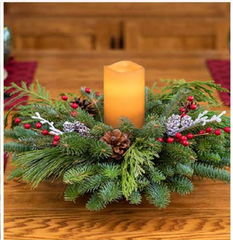
The Candlelit Centerpiece $55.00

This live table top Christmas tree arrives with seven frosted and glittered pine cones, a star garland accent, an LED Light Set (see page 4), and the perfect northern star tree topper. All trimming arrives with the tree for fun, easy decorating. Each tree comes complete with care instructions.