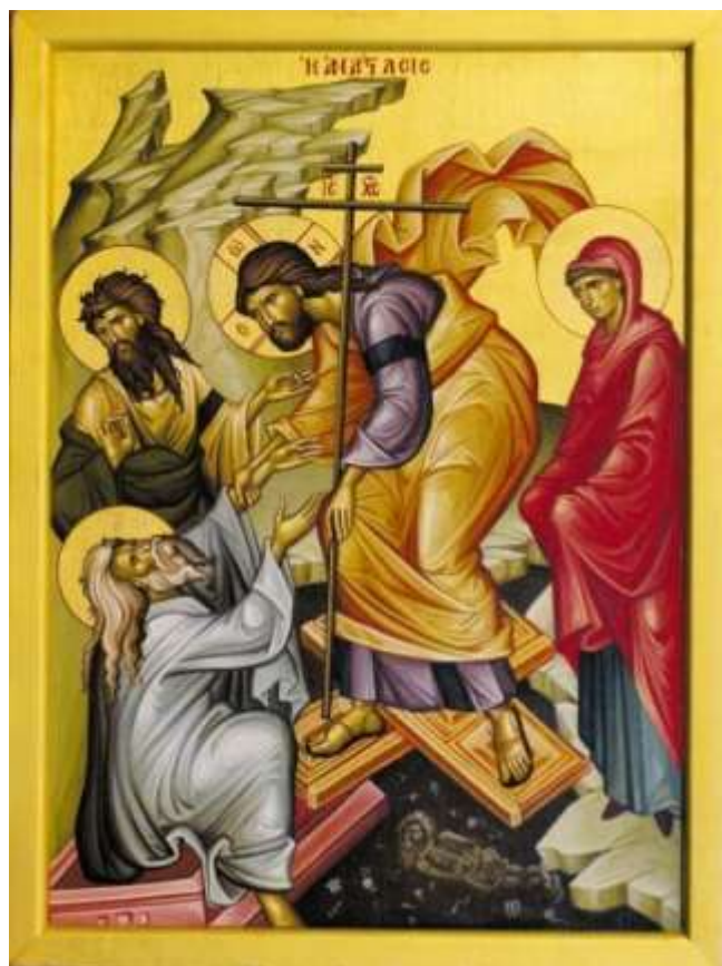
The Resurrection of our Lord, God and Savior Jesus Christ

Χριστός Ανέστη ~ Αληθώς Ανέστη!!! Christ is Risen ~ He has Risen indeed!!!