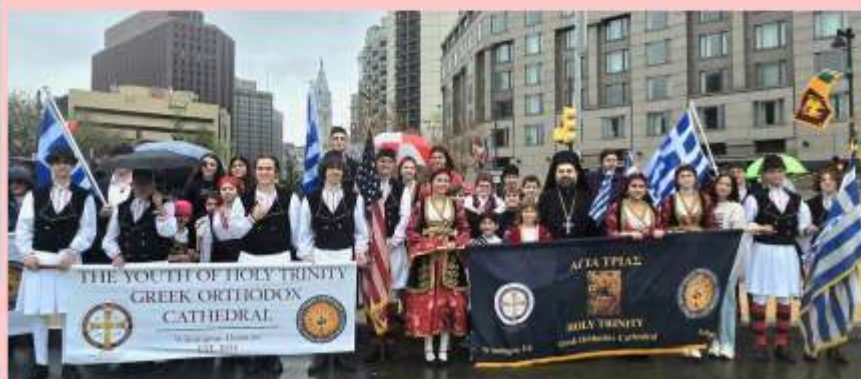
All Youth at the Parade