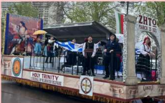
JOY & HOPE on the Parade Float

In April, we celebrated our Greek Heritage at the Greek Independence parade. We also prepared ourselves for the Resurrection of our Lord and celebrated a beautiful and glorious Pascha. This month we focus on learning our Greek dances that we will perform at our Wilmington Greek Festival in June.