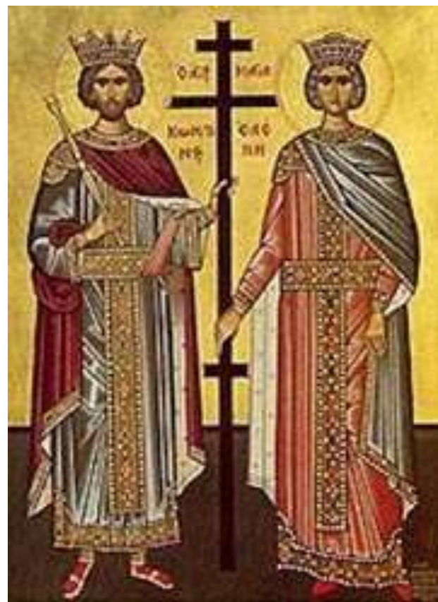
Sts. Constantine and Helen Equal to the Apostles