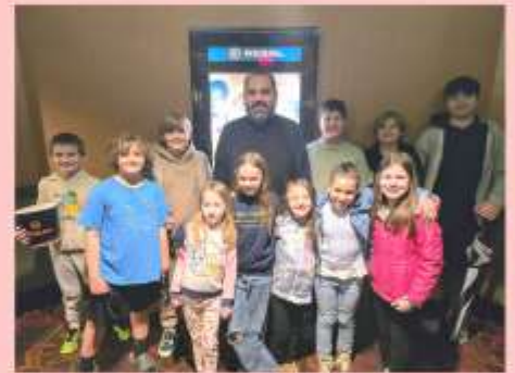
Movie Night at "King of Kings"